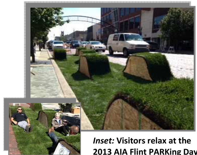
Inset: Visitors relax at the 2013 AIA Flint PARKing Day installation, downtown Flint