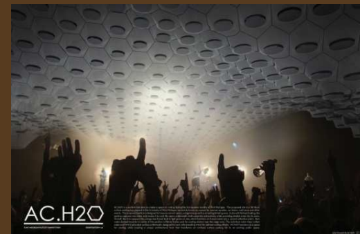
Above: Submissions receiving Honorable Mention, left to right: Stage a Lot ; Building Bodies for Work ; AC.H2O