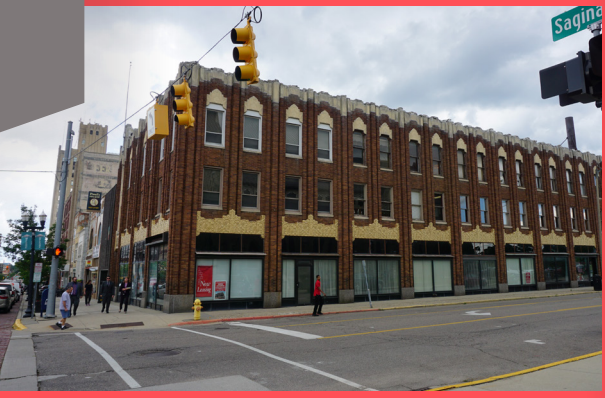
16. Paterson Building Address: 635 South Saginaw St. Architect: Unknown, Year Unknown

This 3-story masonry structure exhibits the flair of the Art Deco period, with stylized geometric trim and floral-patterned panels. Strong vertical piers emerge, rising to a decorative stone cornice. Storefront glazing spans between piers. Windows and doors are embellished with ornately carved stone panels. Art Deco lettering is carved into the stone above the building's entrance.