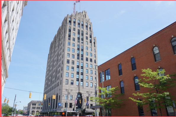
14. Mott Foundation Building Address: 503 South Saginaw Street Architect: Smith, Hinchman & Grylls, 1929-30 Restoration: THA Architects Engineers

Dating back at least 300 years, Saginaw Street is one of the oldest thoroughfares in the United States to bear its original name. The road was upgraded in 1829 from a Native American trail to a military road that linked Detroit with ports to the north. The first brick surface was laid in 1899 and rebuilt in 1936. The road surface has been gravel, logs, planks, and one-foot thick wood blocks. In 2002 the Flint – Vehicle City Arches were rebuilt to original specification and the lights were turned on for the first time since 1919.