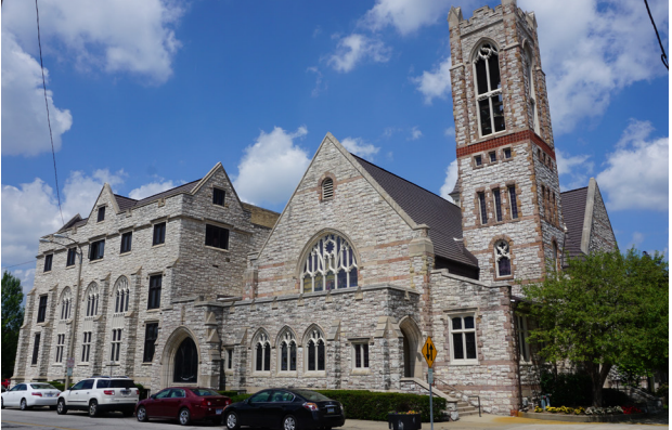
27. First Presbyterian Church Address: 746 South Saginaw Street Architect: Lawrence Valk, 1884, Church House 1928, Classrooms, 1954. Addition: SSOE, 1984

Originally built as a Vernor's "Soda Pop Shop," Halo Burger's stucco exterior, red tile insets, and roof are typical of Mission Style architecture. The parking lot was once the Vernor's Gardens outdoor dining area. The Vernor's mural on the wall facing the building was completed in 1932 and depicts the characteristic Vernor's gnomes making their ginger ale and preserving it in wooden barrels, working against a backdrop of castles.