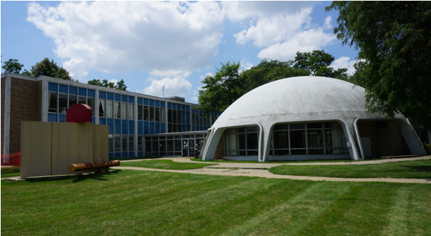
23. Flint City Hall / Address: 1101 South Saginaw Street Architect: Bevestor and Associates, Inc., 1955

The law practice of Palavin, Palavin & Powers chose the name of their new office building when they were forced to rebuild after a fire. The building design is divided into two elements: the first, are two cubes with large glass areas on both north and south sides, the second, a sunken plaza between the two cubes. Italian marble contrasts red-orange window frames. This building is now home to the Young Women's Christian Association.