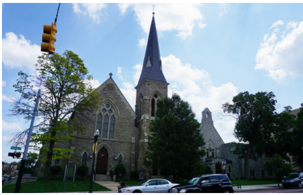
20. Saint Paul's Episcopal Church Address: 711 South Saginaw Street Architect: Gaden Lloyd, 1873

This Gothic revival structure is constructed of native limestone from a quarry in Flushing, MI. Builder W.A. Patterson hand-wrought the iron cross which crowns its spire. In 1915 a new parish house and the Five Sisters Chapel were added to the church grounds. The church contains many Tiffany Co. stained glass windows. The structure's original deteriorating slate roof was replaced in 2000.