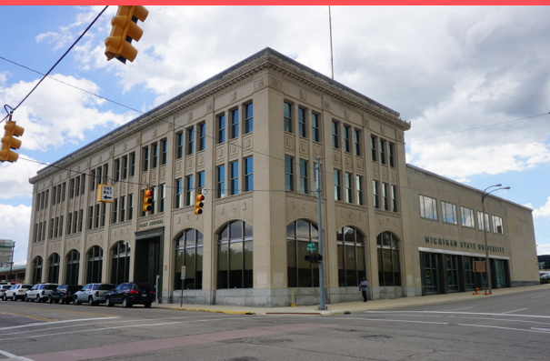
18. Flint Journal (Original) Address: 200 East First Street Architect: Albert Kahn, 1924

The adaptive reuse of the abandoned Flint Journal's printing and press facility created a new farmers' market for the city of Flint. The new market provides an exciting year-round venue for shopping; educational classes on gardening, health and nutrition, and a flexible venue for entertainment and events. The 4-story atrium, now features seating above and below. The Flint Farmers' Market is a must-see on any visit to Michigan.