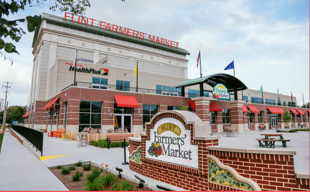
17. Flint Farmers' Market Address: 300 East First Street Architect: Dario Designs, 2004 Adaptive Reuse Architect: FUNchitecture, 2014

This 3-story masonry structure exhibits the flair of the Art Deco period, with stylized geometric trim and floral-patterned panels. Strong vertical piers emerge, rising to a decorative stone cornice. Storefront glazing spans between piers. Windows and doors are embellished with ornately carved stone panels. Art Deco lettering is carved into the stone above the building's entrance.