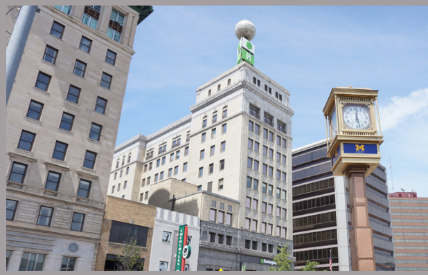
28. Huntington Bank (formerly: Citizens Bank) Address: 328 South Saginaw Street Architect: Unknown, 1928

Designed in the Greek Revival style, the granite sculpted elements of the buildings include volutes, festoons, medallions, and Grecian urns located on the corners. The weather ball, added in 1956, has endured through various ownership acquisitions, and remains a recognized landmark for Flint locals and an orientation point for the City.