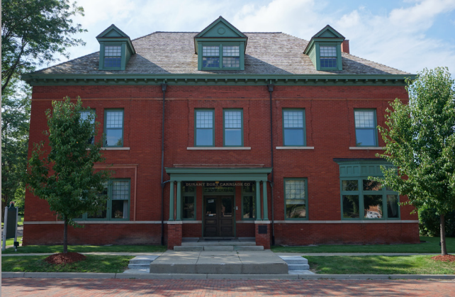
33. Durant Dort Office Building Address: 315 West Water Street Architect: Unknown, 1896 Restoration: Chambers & Chambers | SSOE

The larger of the buildings, a two-story brick structure, was constructed in 1887-1888. The smaller one-story structure was the original factory for the company that would eventually become General Motors. The red brick masonry walls, heavy timber framing and evenly spaced double-hung windows were common characteristics of industrial architecture until the early 1900s. Now known as Factory I it is open to the public by appointment only, and has a car gallery, archives, and conference spaces.