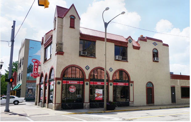
26. Halo Burger and Vernor's Mural Address: 800 South Saginaw Street Architect: Unknown, 1929 Mural Artists: John Gonsowski and Keith Martin, 1932

The church you see today is the fourth building that has been built for the United Methodist Church in Flint over the past 150 years. The New Gothic Style building was constructed of brick, with a slate roof and cut-stone trimmings. The sanctuary seats 1,200 and is one of Flint's largest. It also contains eight stained glass windows depicting the Beatitudes, including the lamp of knowledge, an open book, scales of justice, and the Ten Commandments.