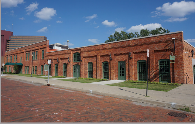
32. Durant Dort Carriage Factory Address: 310 Water Street Architect: Unknown, 1886 Restoration: Gerald Yurk & Associates Renovation: SmithGroup, 2017

The design of this building followed classical three-part design. The architect was inspired by the Temple of the Four Winds in Athens, Greece. The upper two floors which top the building are accentuated with a copper-clad penthouse with great views of Flint. The building is now owned by the University of Michigan – Flint and houses various offices and classroom spaces.