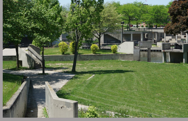
30. Riverbank Park Address: Saginaw Street at the Flint River Architect: Lawrence Halprin, 1977-1978

First Street Lofts is a seven-story Classical Revival building. The building is located on a corner lot and has a decorative entrance on each primary facade. The facade facing Saginaw has an elaborate, deeply recessed central entryway topped with an arched window and a carved eagle sculpture. The entry is marked by large Ionic piers.