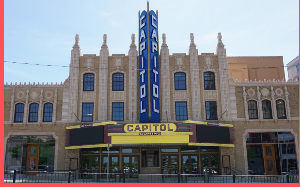
15. Capitol Theater Address: 140 East Second Street Architect: John Eberson, 1927-1928 Restoration Architect: DLR Group | Westlake Reed Leskosky, 2018

Flint's first and most prominent Art Deco high rise was designed by Smith, Hinchman & Grylls, now SmithGroup. Art Deco took on a distinct character of its own in America. Utilizing the latest advances in technology and materials, the style was hallmarked by geometric shapes and streamlined simplicity. The extent of the Art Deco influence can be seen in everything from the stylized limestone reliefs to the interior handrail brackets.