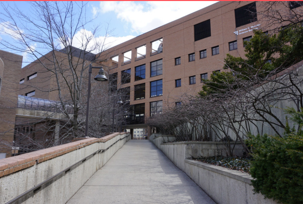
19. University of Michigan – Flint / Address: 303 Kearsley Street Architect: Various

Above each of the arched windows along Harrison Street are relief figures representing knowledge, research, and literature. Along First Street, the reliefs represent science, art, music, printing, and engraving. Below the upper floor windows are reliefs of prominent printers and the attributes of a free press. In 1978, a mural by Blue Sky, titled, "Overflow Parking", was painted on the east façade. This building has been renovated into loft apartments and classrooms for the Michigan State University Extension.