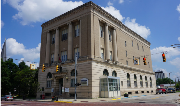
21. Flint Masonic Temple Address: 755 Saginaw Street Architect: H.B. Clement, 1911

This Gothic revival structure is constructed of native limestone from a quarry in Flushing, MI. Builder W.A. Patterson hand-wrought the iron cross which crowns its spire. In 1915 a new parish house and the Five Sisters Chapel were added to the church grounds. The church contains many Tiffany Co. stained glass windows. The structure's original deteriorating slate roof was replaced in 2000.